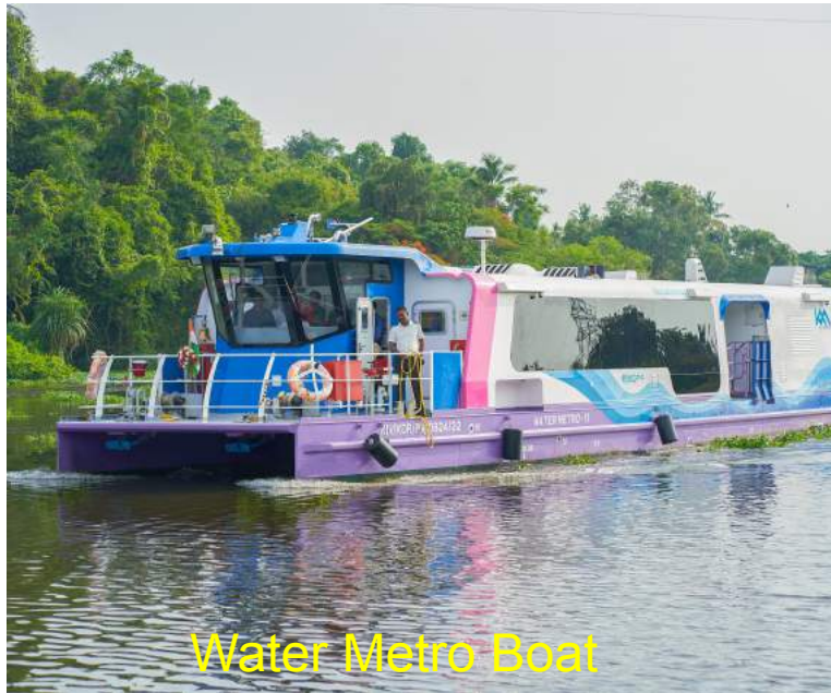
Water Metro Boat