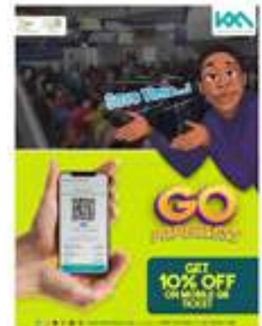
Kochi 1 Mobile QR Ticket