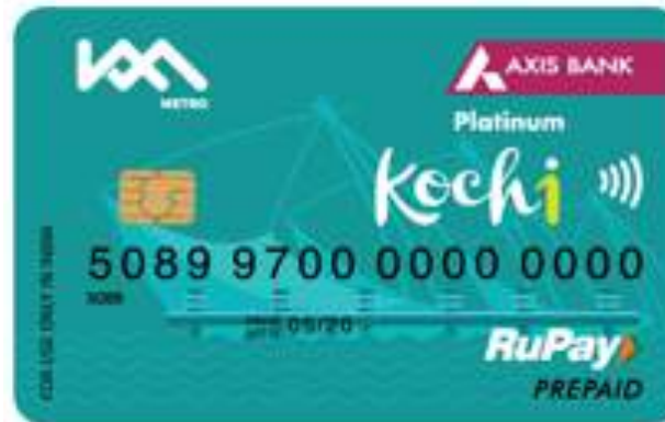
Open Loop Travel Card. Can be used in Metro, Water Metro, Feeder Bus and Feeder Auto