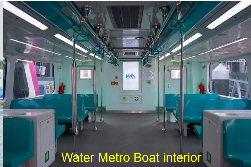
Water Metro Boat interior